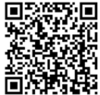
The Invisible Rope

Just grab a friend and put your acting chops to good use