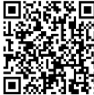
The Door Tie

Or any other creepy critter that nobody wants near them